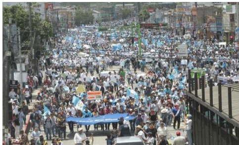
Protests in the Streets