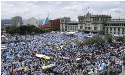
Protest in front of the Presidential Palace